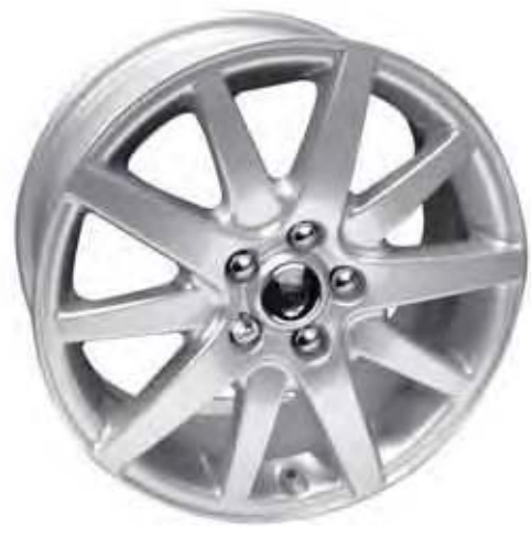
SPORTS 17" XR8 43333