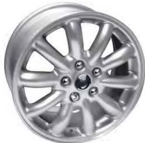
SPIRIT 16" XR8 43323