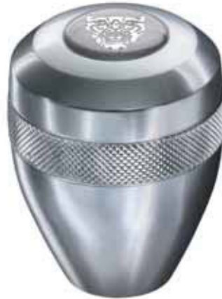
Brush Aluminum With Growler Top