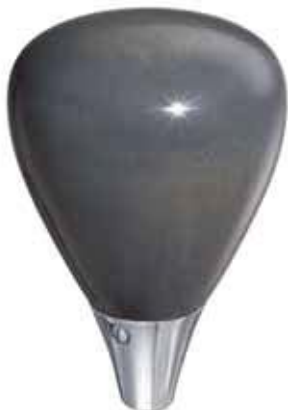
All-Wood Grey Stained