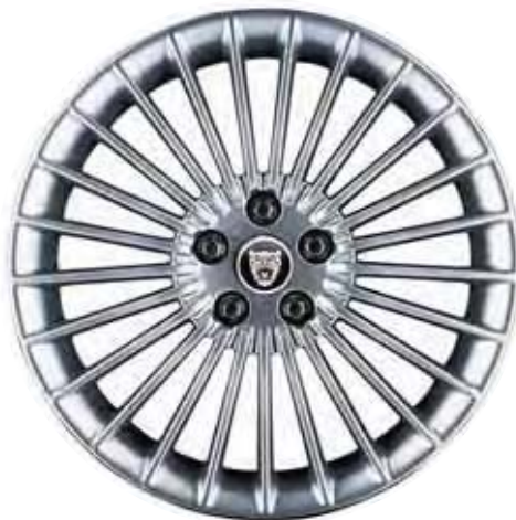
MERCURY 18" XR8 42129