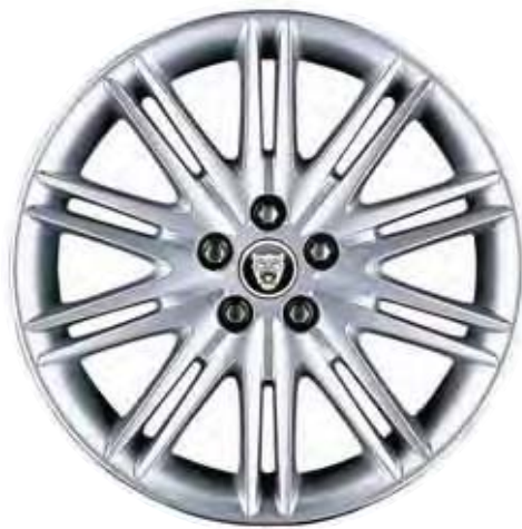
TRITON 18" XR8 31513

NOTE: Wheels may require different tires. Ask your Jaguar sales consultant for details. Center caps and wheel nuts not included.