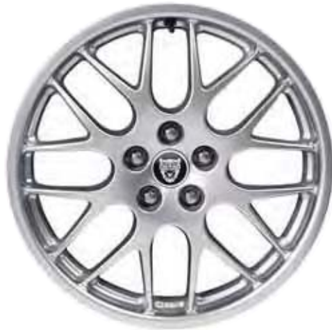
VALENCIA 18" XR8 52046