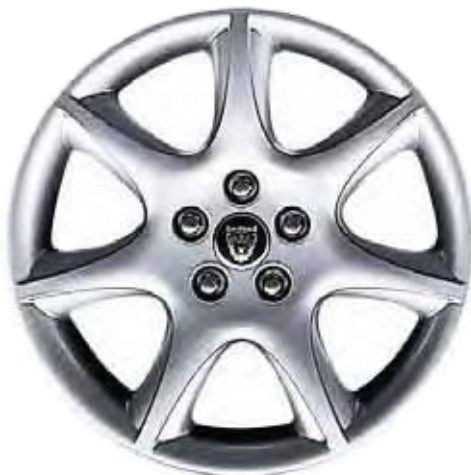
JUNO 17" XR8 31511