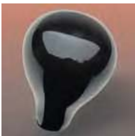
Wood smoke grey