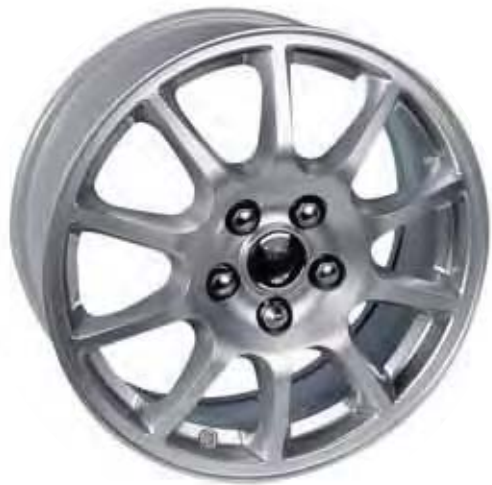
HELIOS 16" XR8 17325