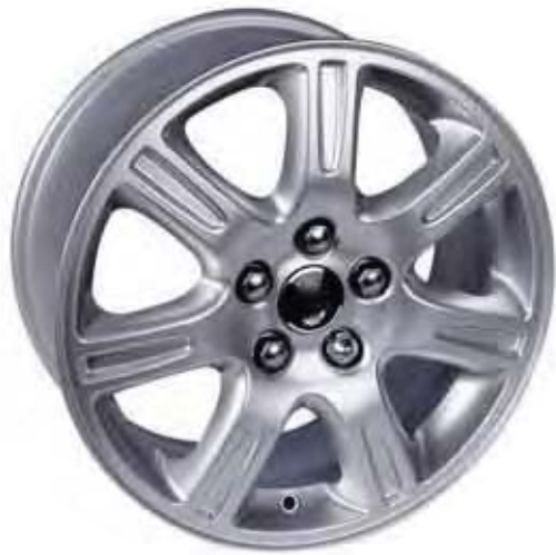
ARTEMIS 16" XR8 43322