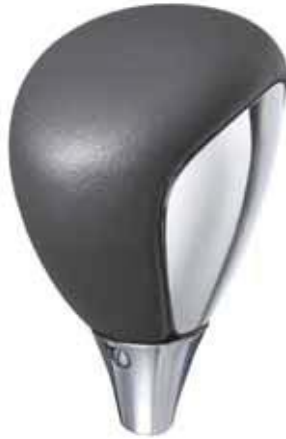
Leather Gear Knob Charcoal