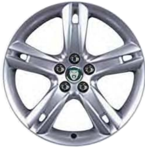
VULCAN 18" (8" X 18") FRONT XR8 31514