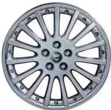
INDIANAPOLIS 18" XR8 28714