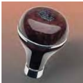
Wood walnut with chrome insert