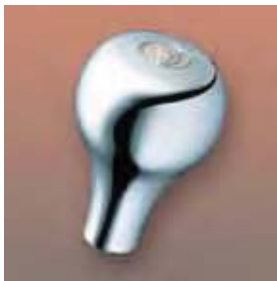
Alloy with chrome insert