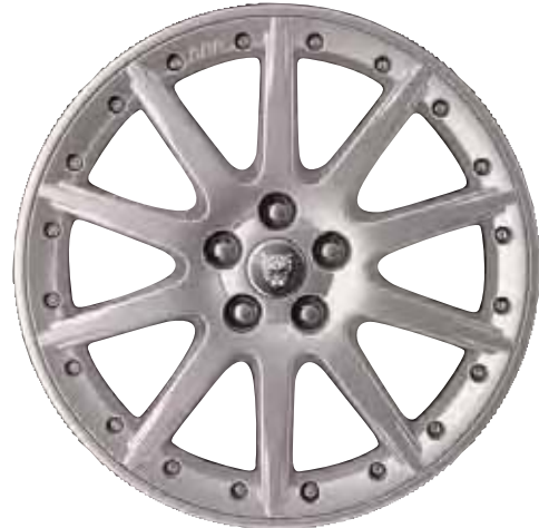
MELBOURNE 18" C2S 16590