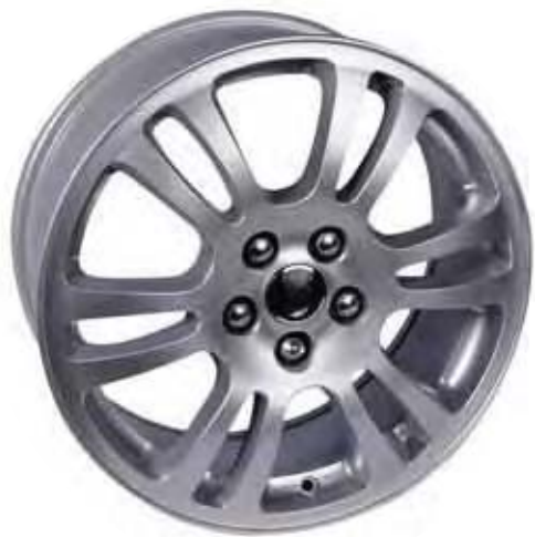
KRONOS 17" XR8 17328