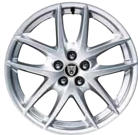
BARCELONA 19" Front XR8 53029 Rear XR8 51963