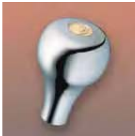
Alloy with gold insert