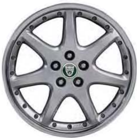
MONACO 18" (SILVER) XR8 26421

YOUR S-TYPE HAILS FROM A CAR COMPANY WHOSE LINEAGE IS ROOTED IN RACING and modern performance technology. Celebrate that exclusive heritage with Jaguar R Performance accessories.