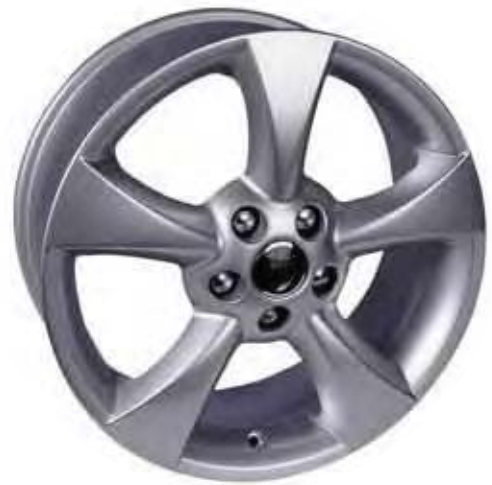
HERAKLES 17" XR8 43330