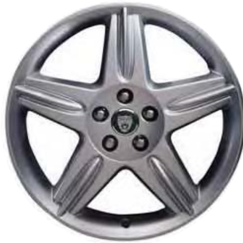
ZEUS 18" (8" X 18") FRONT XR8 43331