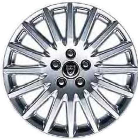
AURORA 17" XR8 31512

ALLOY WHEELS ADD A DISTINCTIVE, sporty design cue to your sleek S-TYPE. Engineered for both durability and appeal, they exude performance and style.