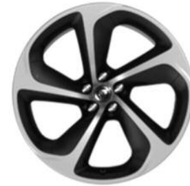
20" Forged Rotor 5-spoke Opt - F-TYPE R