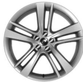
20" Cyclone twin 5-spoke Satin Dark Grey Std - British Design Edition Silver or Black finish Opt - F-TYPE Premium