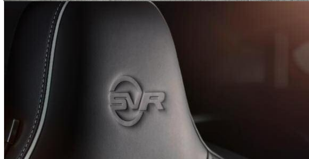
F-TYPE SVR Coupe in Firesand