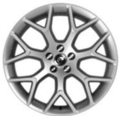
19" Centrifuge web-spoke Silver or Black finish Opt - F-TYPE S RWD