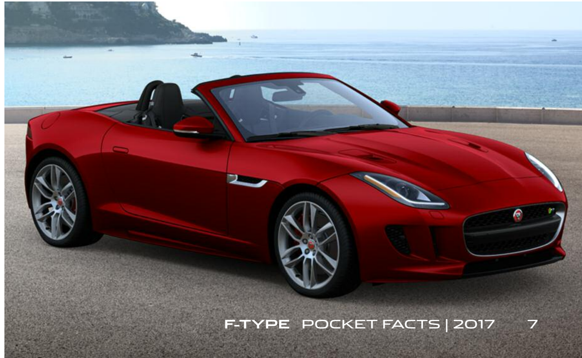
F-TYPE R Convertible