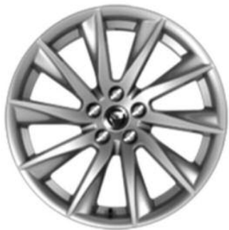
18” Vela 10-spoke alloy Std - F-TYPE, F-TYPE Premium

Note: F-TYPE does not offer any wheel options. See wheel section for F-TYPE Premium options