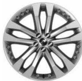
20" Tornado twin 5-spoke Silver Opt - F-TYPE S Black Opt - F-TYPE S, F-TYPE R