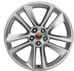
19" Volution twin 5-spoke Silver finish Std - F-TYPE S AWD Grey with diamond turned Opt - F-TYPE S AWD