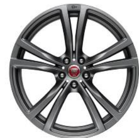
20" Forged Coriolis twin 5-spoke Satin Technical Grey Std - F-TYPE SVR Black Opt - F-TYPE SVR