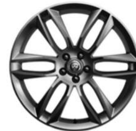
20" Gyrodyne twin 6-spoke Silver finish Std - F-TYPE R Black diamond turned Opt - F-TYPE R