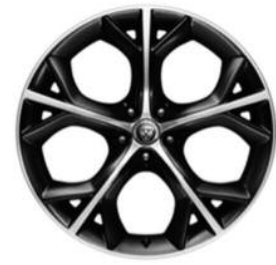
20" Forged Storm 5-spoke Part of Carbon Ceramic Matrix Brake Package Opt - F-TYPE S, F-TYPE R