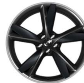
20" Forged Blade twin 5-spoke Carbon Fiber trim Opt - F-TYPE S F-TYPE R