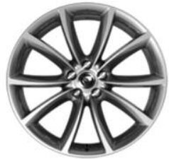
19" Propeller 10-spoke Silver finish Std - F-TYPE S RWD