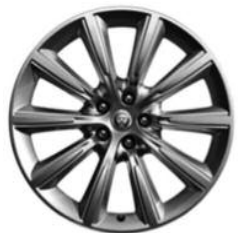
19" Orbit 10-spoke Silver or Black diamond turned Opt - F-TYPE S, F-TYPE Premium