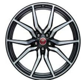
20" Forged Maelstrom twin 5-spoke Part of Carbon Ceramic Matrix Brake Package Opt - F-TYPE SVR