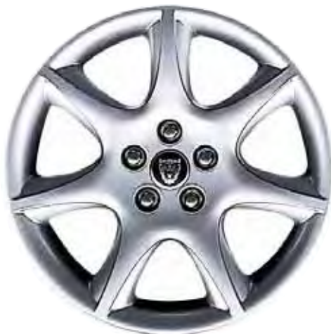
JUNO 17" XR8 31511