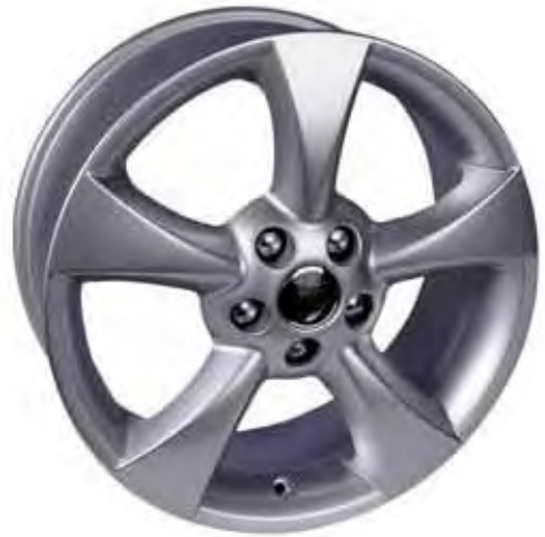
HERAKLES 17" XR8 43330