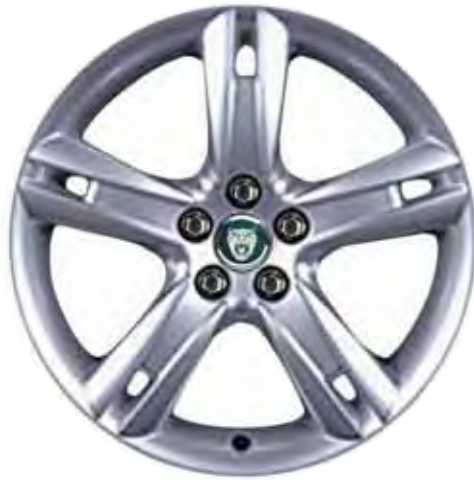
VULCAN 18" (8" X 18") FRONT XR8 31514