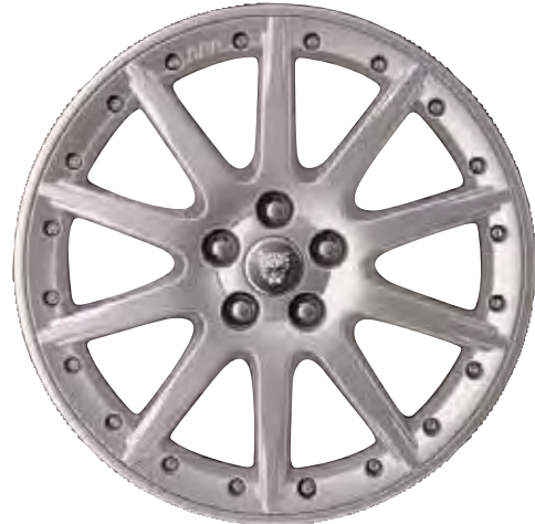
MELBOURNE 18" C2S 16590