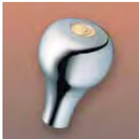
Alloy with gold insert