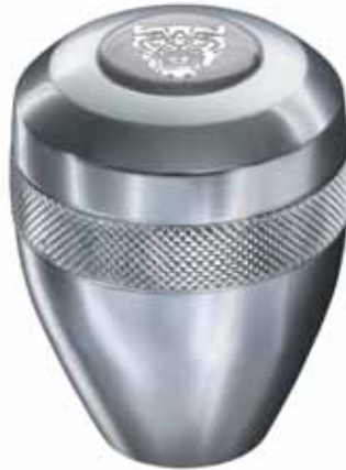
Brush Aluminum With Growler Top