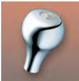
Alloy with chrome insert