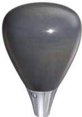
All-Wood Grey Stained