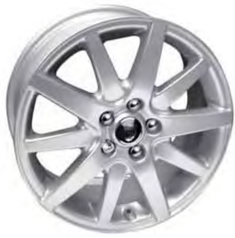
SPORTS 17" XR8 43333