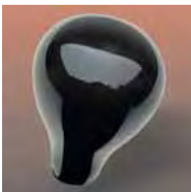
Wood smoke grey