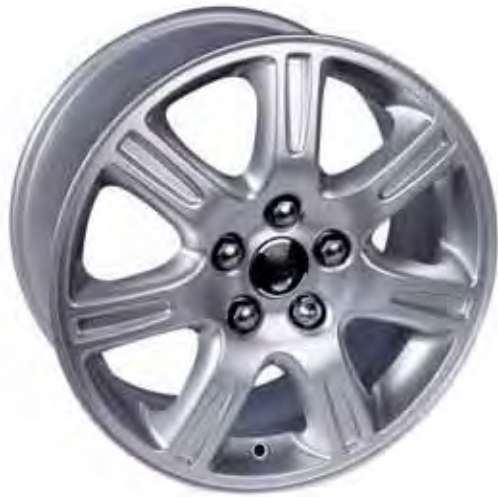
ARTEMIS 16" XR8 43322