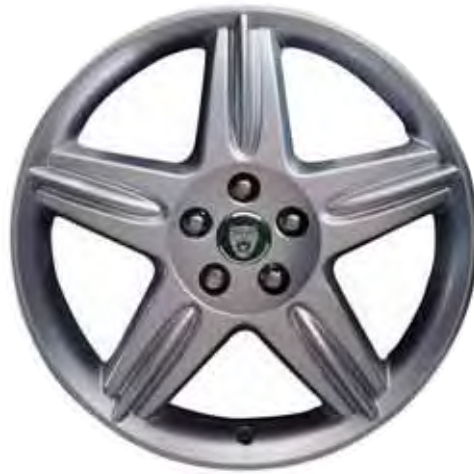
ZEUS 18" (8" X 18") FRONT XR8 43331