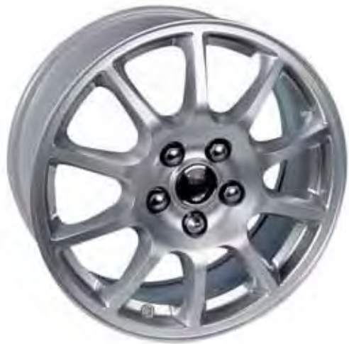
HELIOS 16" XR8 17325