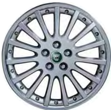
INDIANAPOLIS 18" XR8 28714