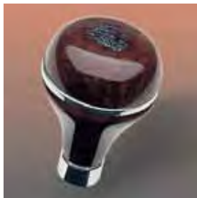
Wood walnut with chrome insert