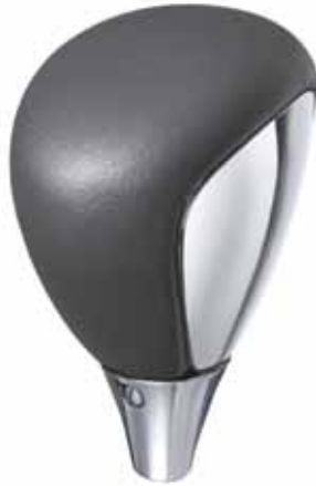
Leather Gear Knob Charcoal