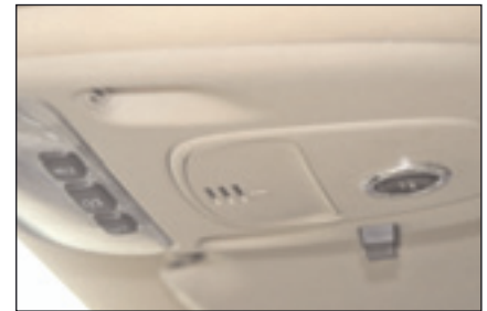
Leather headlining and a separate starter button for the engine.

into life instantly without assistance from the throttle. Immediately the differences start to kick in with the outrageous sound from the exhaust system which creates a slight vibration through the floor. Once on the road, however, the sound is more