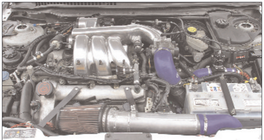
The real business end with the very well installed and neat supercharger layout from Elite & Performance.

into life instantly without assistance from the throttle. Immediately the differences start to kick in with the outrageous sound from the exhaust system which creates a slight vibration through the floor. Once on the road, however, the sound is more