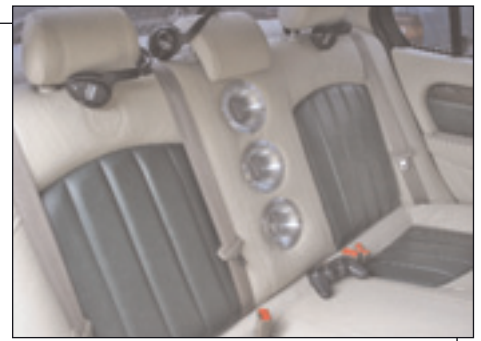
Embossed growler badging to the seats and extra speakers for the sound system. Not sure if the head-sets are there to protect your ears or for you to listen with if the sound isn't loud enough!

You now start the car on a button in the overhead console and the engine burst