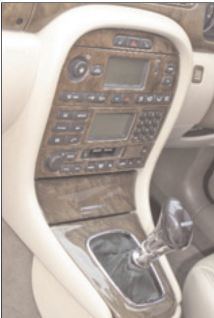
Extra wood veneer added to good effect if not a perfect match for the original.

supercharging, the major issue was space. Because it is such a tight installation it can only be carried out on manual transmission models.