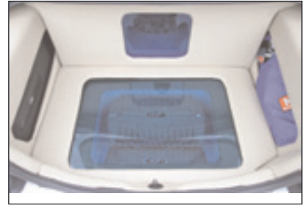
The business end of the sound system, all 1,000 watts of it with its own illumination and growler glass. No spare wheel any more. The blue covering on the right hides the nitrous oxide storage tank, currently disconnected.