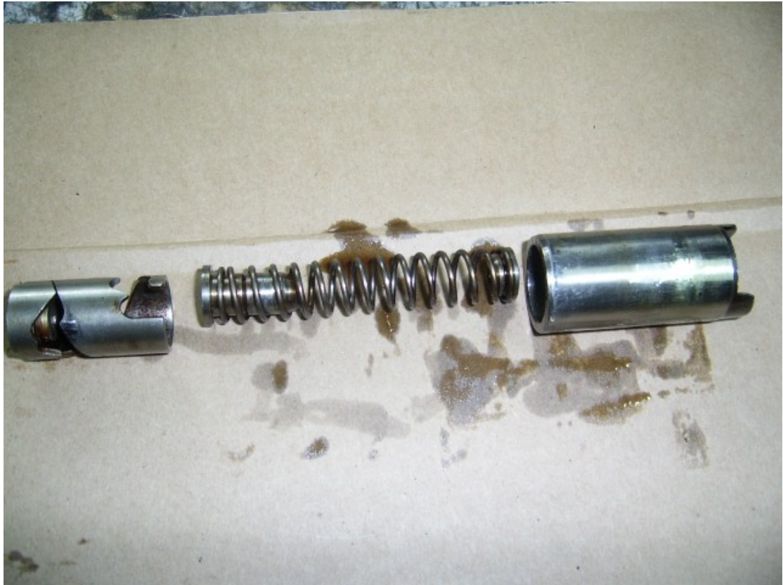
Figure 4 Spring assembled correct as supplied from Jaguar.