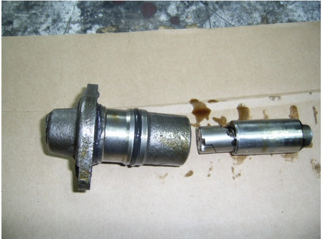
Figure 2 The 2 main components, spring loaded plunger on the right.