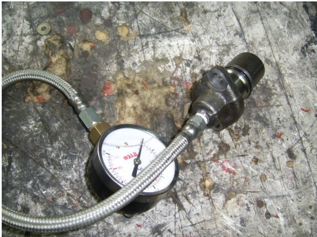
Figure 7 Old unit with pressure gauge attached

I am NOT convinced I found anything, but at least now I/we have oil pressure readings at the tensioner. This pressure is slightly higher than I had at the oil filter housing, BUT, that was done some time ago and the engine was due for an oil change, and this time the oil is only 1000km old, and I accept these figures as true for my engine. Pretty damn good in anyone’s opinion I reckon.