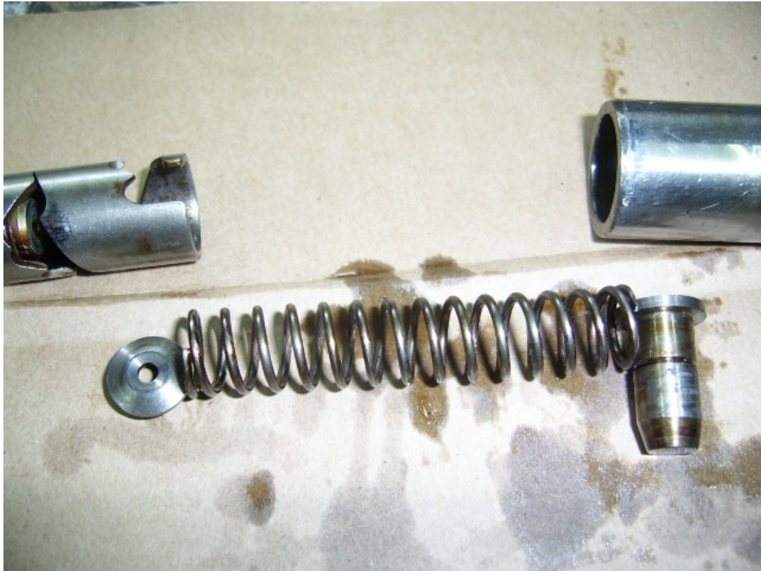
Figure 6 This is the INCORRECT assembly

Picture “1” shows the unit as received from Jaguar, including the box with the latest Part No.