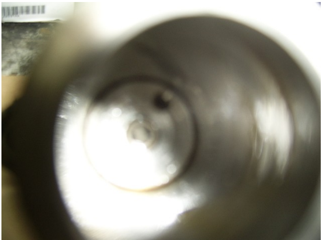
Figure 3 Oil inlet hole at 1 o'clock with the anti-bleed thingy in the centre.