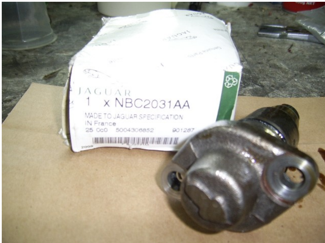
Figure 1 Tensioner as received

assembled it as it came from Jaguar, deciding the OLD unit was incorrectly assembled by some previous unknown and refitted the thing to the car, started the engine and once the initial “unholy rattle” disappeared, the annoying rattle was no more, too good to be true, I am NOT that lucky, went for a drive, no more rev range rattle, parked for a quiet beer under a shady tree, and about 30 minutes later fired it up, NO rattle, fair dinkum, this thing always gave that “ching” at hot start, but no more, drove home, waited again, started it again, and again, all quiet, consumed much beer, then typed this.