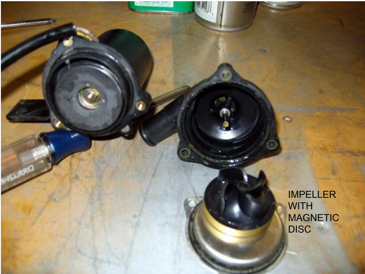
IMPELLER WITH MAGNETIC DISC