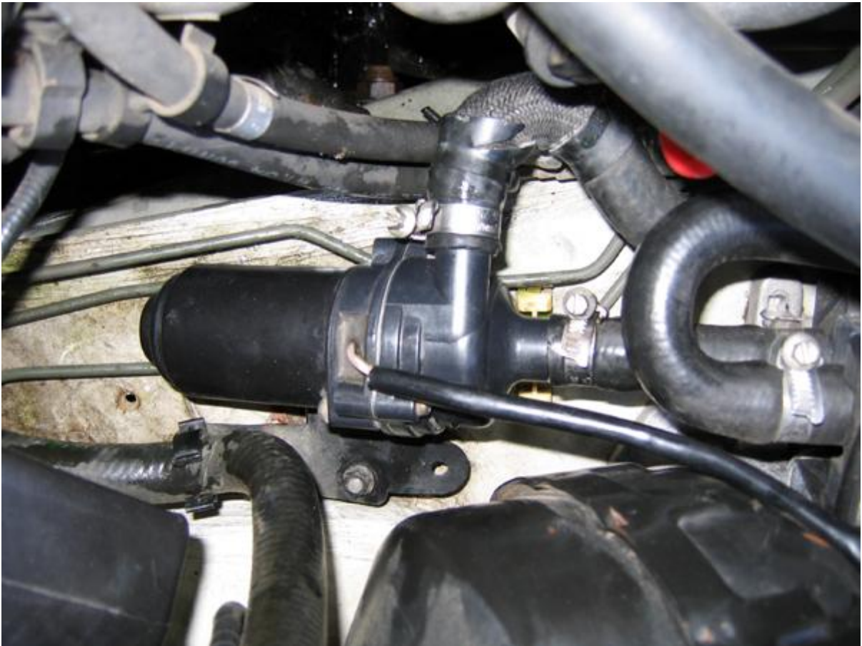
Heater Pump Armature Brush Repair