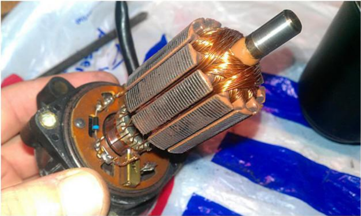
The armature and brushes.