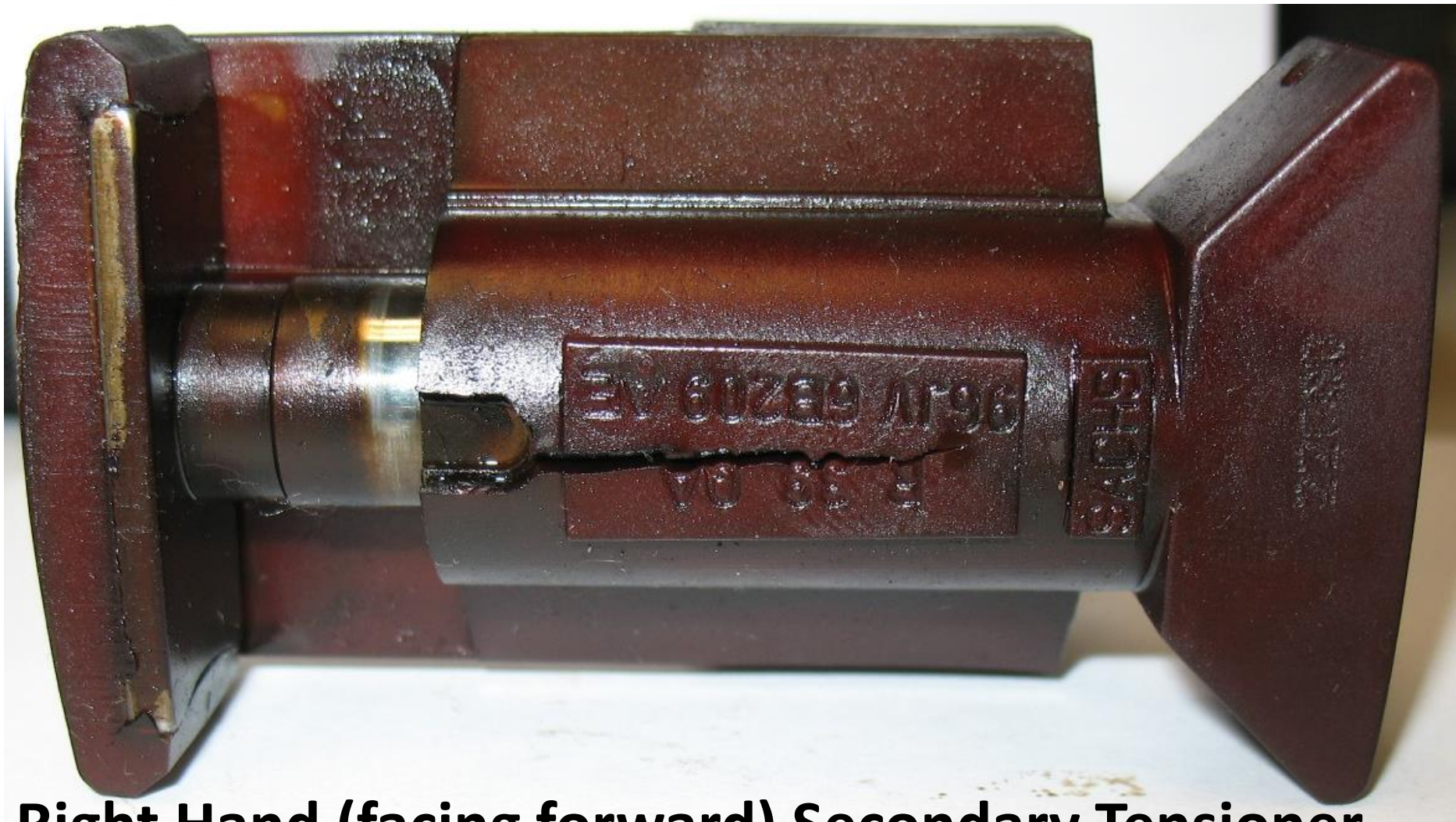
Right Hand (facing forward) Secondary Tensioner