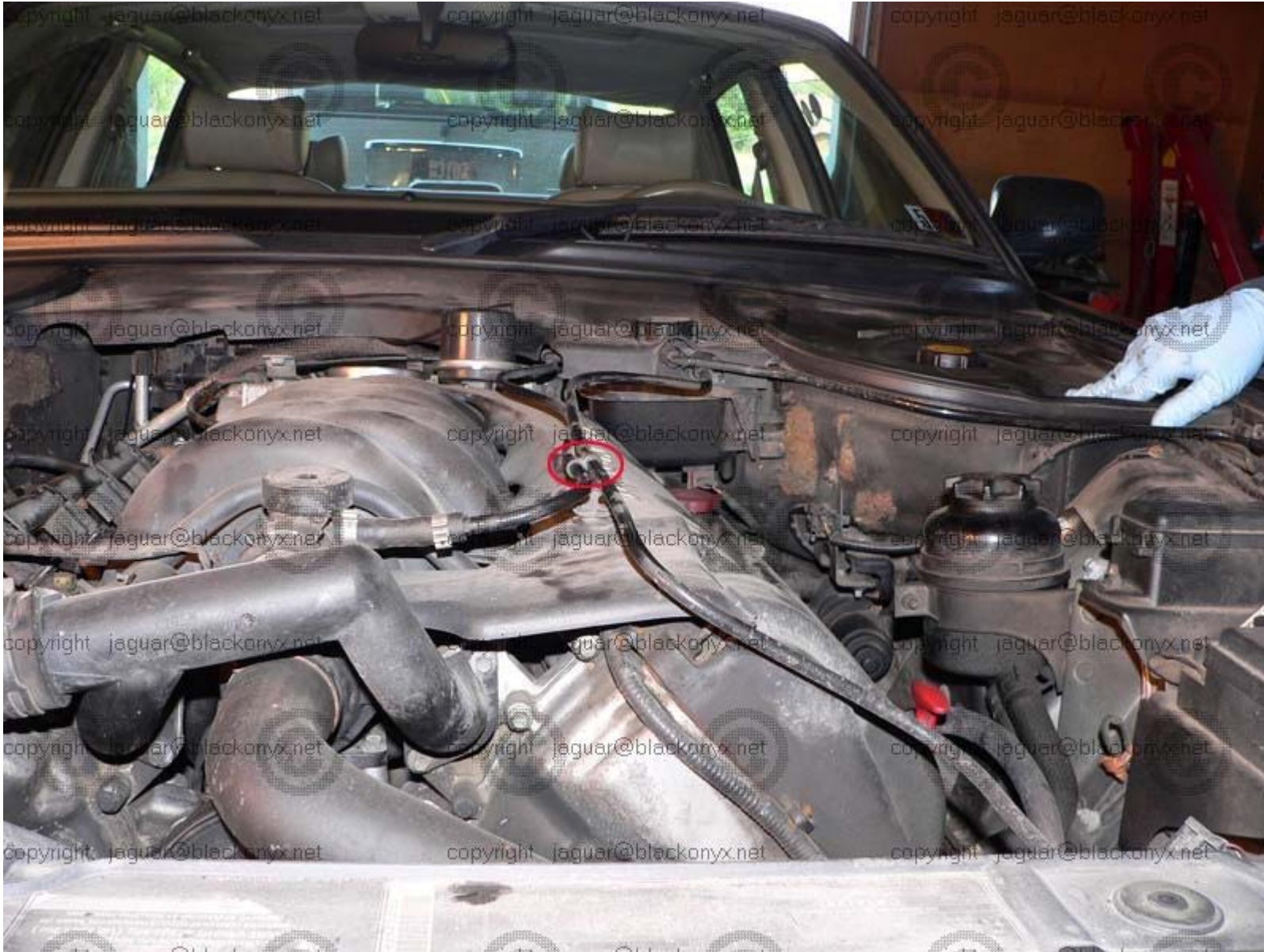
3) Now may also be a good time to drain the coolant from the engine. Easiest way I have found to do this is to