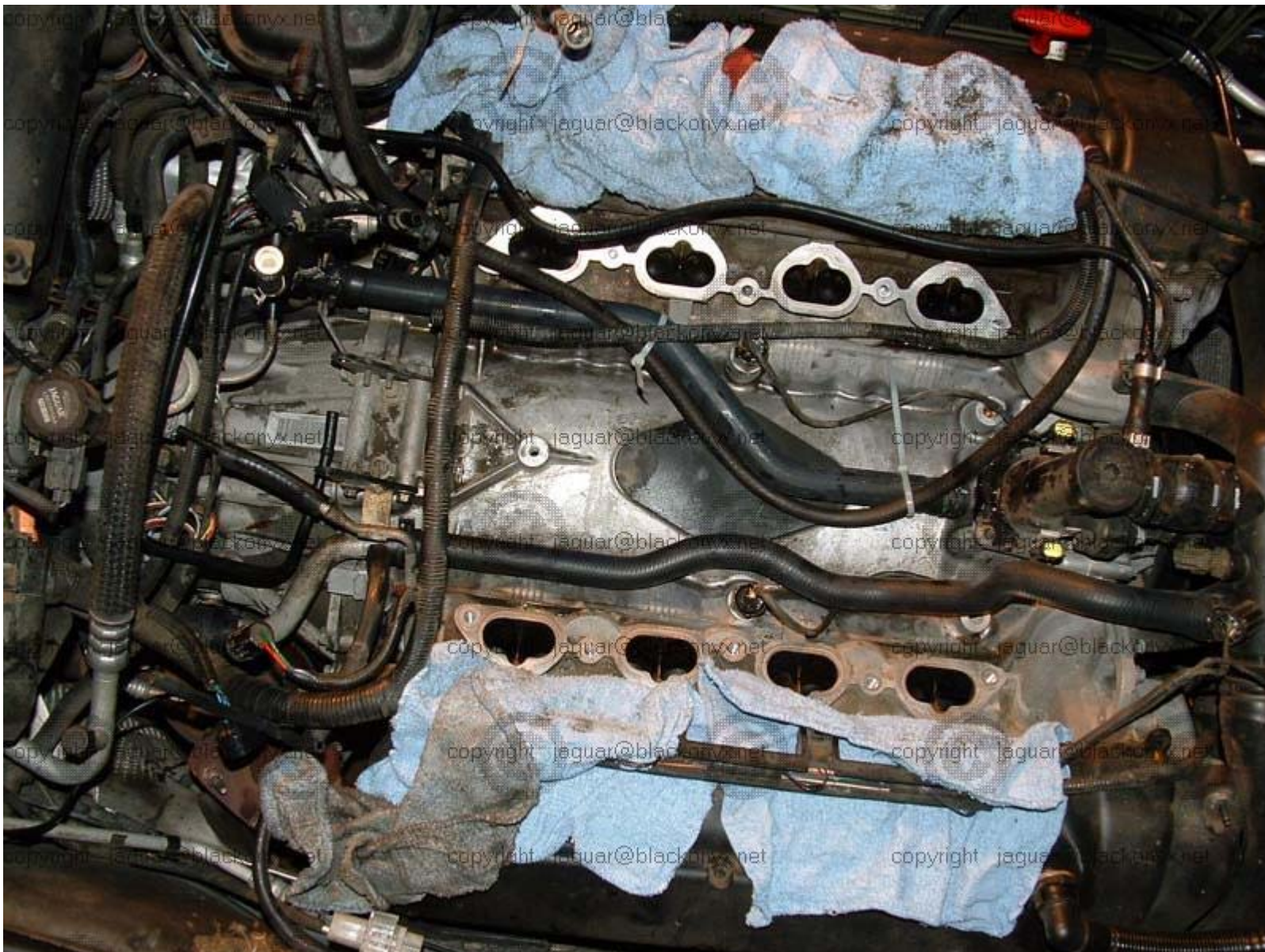
19) Once you have the hoses installed properly clean all the gasket surfaces. This included both sides of the intake ports, the elbow surface and the throttle body surface. Be careful not to scratch the surfaces.