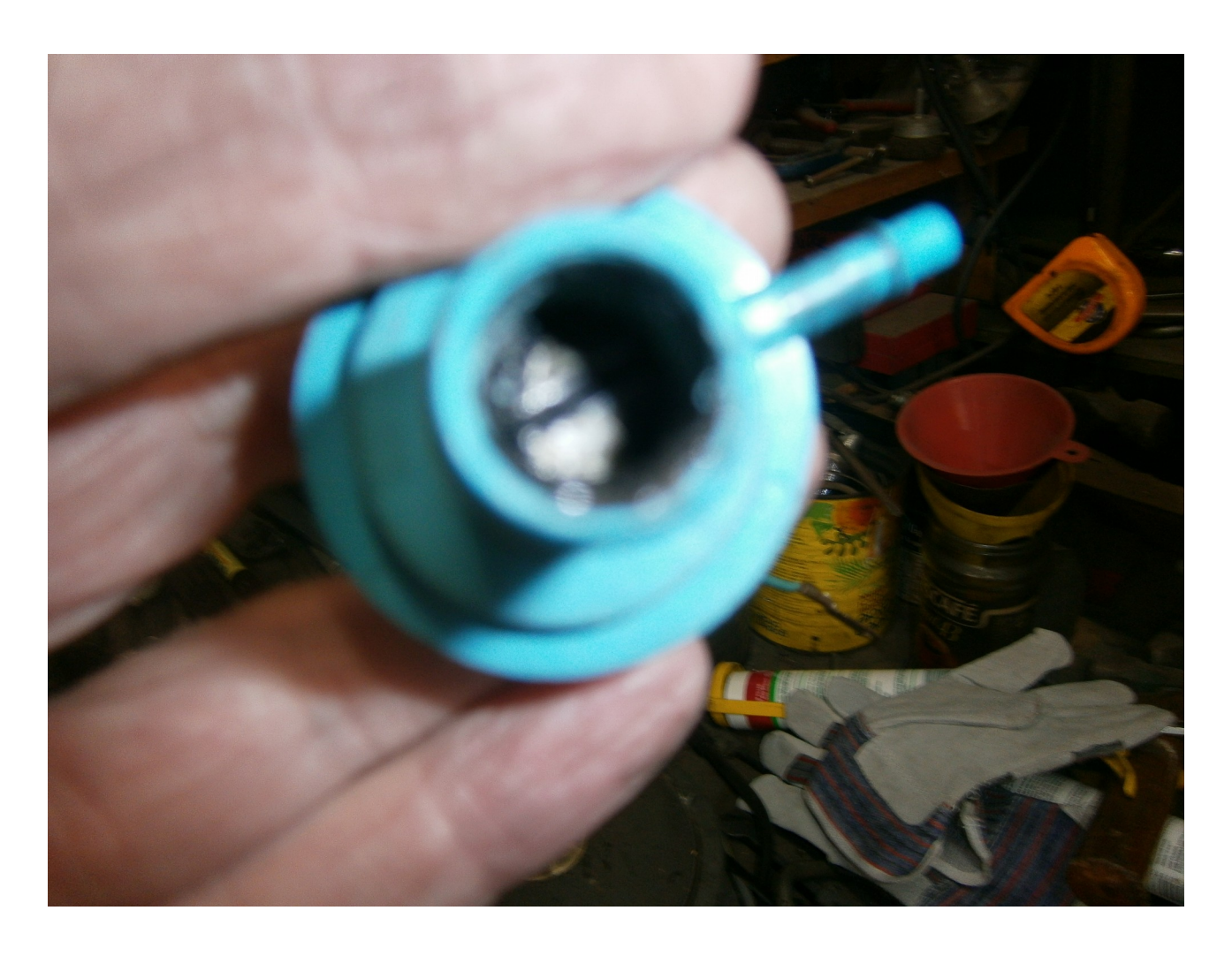
The slot exposed.