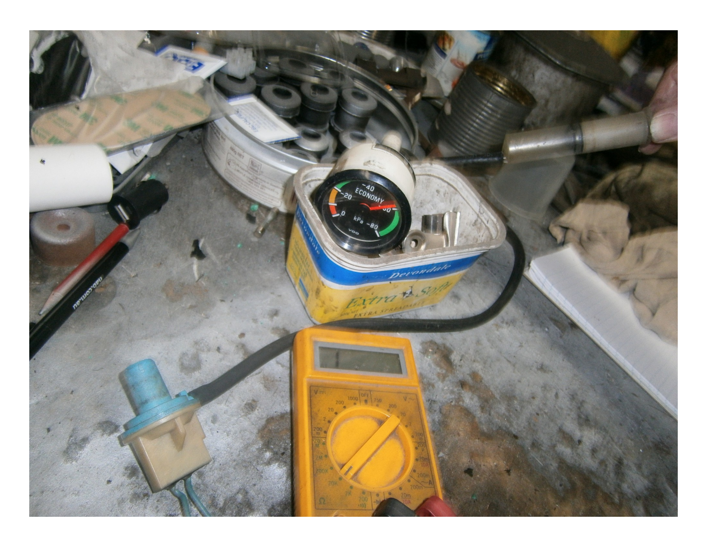
MY normal reading, just cruising around.