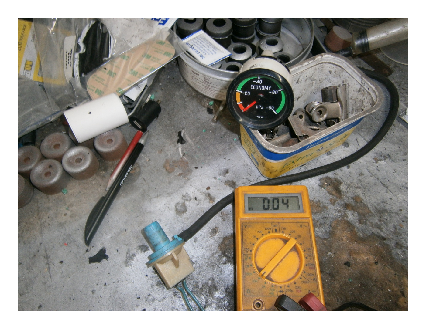
NO vac, contacts closed.