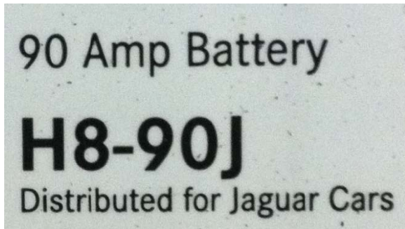
CONVENTIONAL (FLOODED-CELL TYPE) BATTERY LABEL